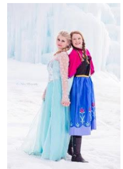
Frozen Anna and Elsa Thurs, Sat, and Sun