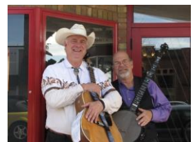
Blue Drifters Duet