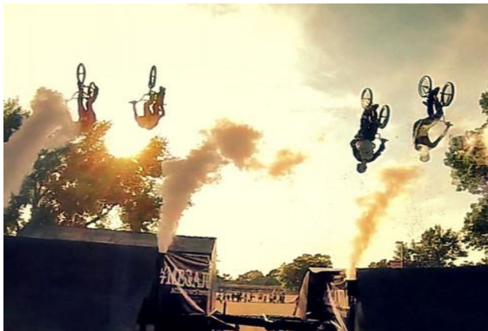
Bike Stunt Show: Wednesday and Thursday at various times---Win a Bike!