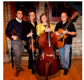
King Wilkies’ Dream Band